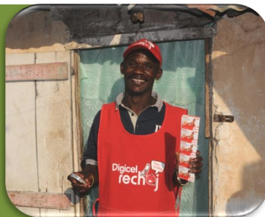
Pictured right: A microloan recipient in Pignon selling cell phone products