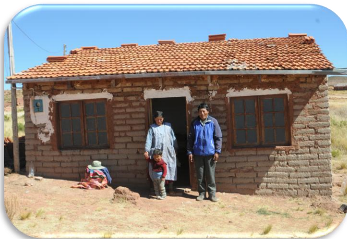
A rural family in front of their home